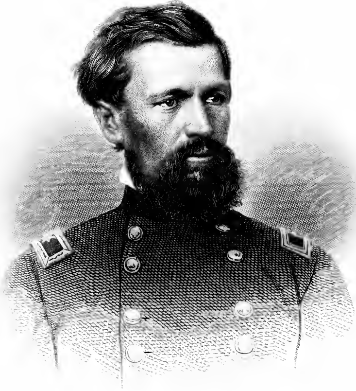
GEN OLIVER O. HOWARD