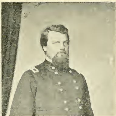
BRIGADIER GENERAL BENJAMIN F. POTTS.