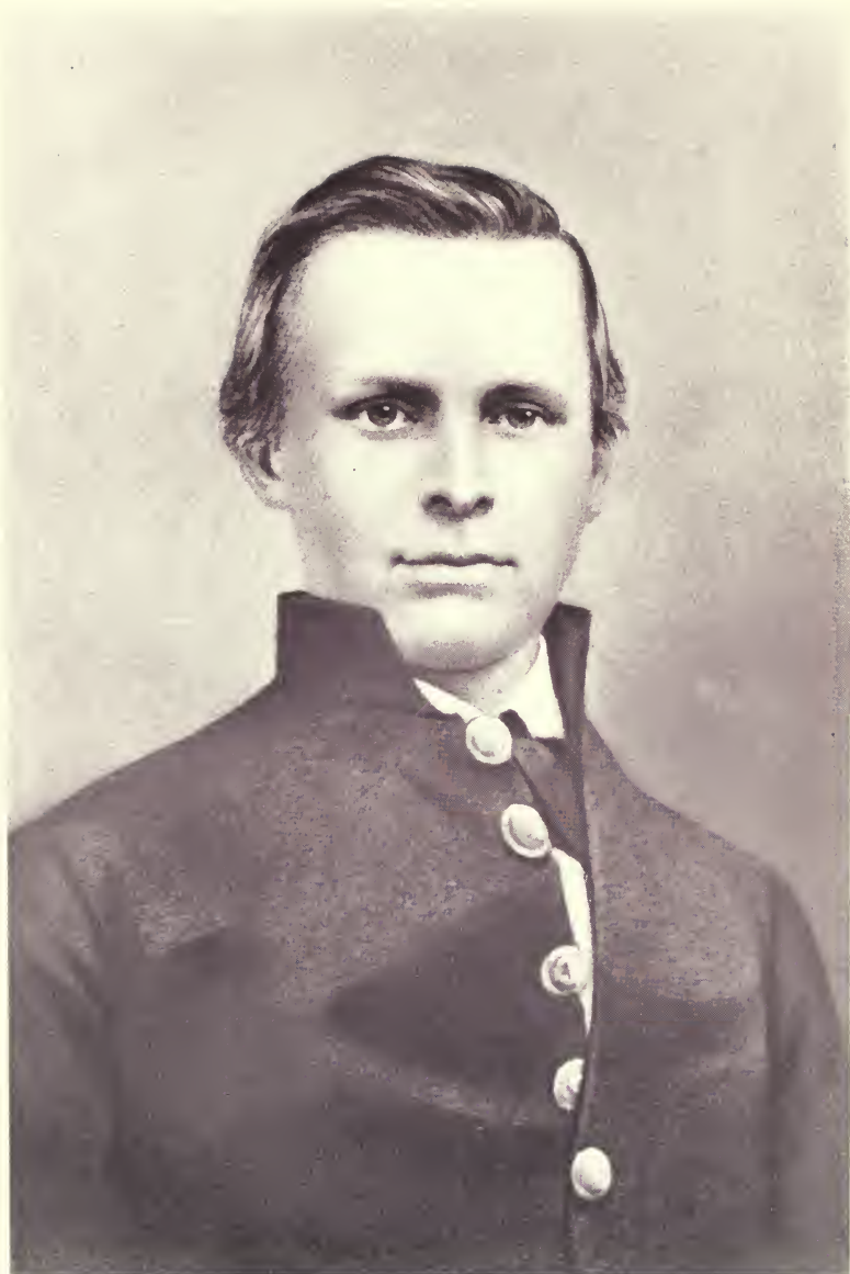
MAJOR JOHN PELHAM CHIEF HORSE ARTILLERY Killed at Kellysville, 1863