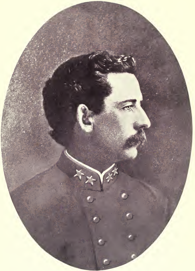
LIEUTENANT-COLONEL ROBERT PRESTON CHEW CHIEF HORSE ARTILLERY