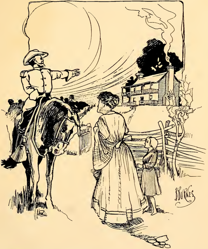
“General Sherman halted and asked in a kindly voice whether she had husband or sons in the war.”