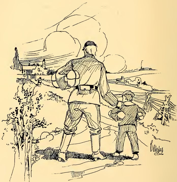
"Uncle Ned's" Return.